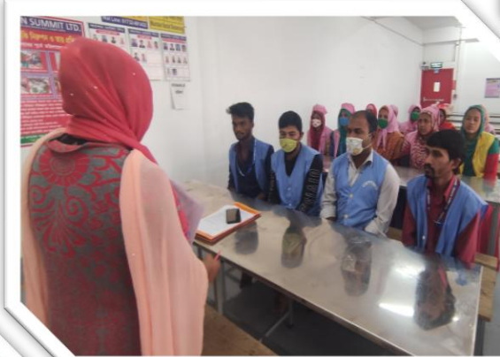
Training and Development