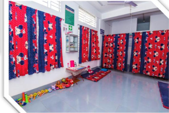
Child Care Room