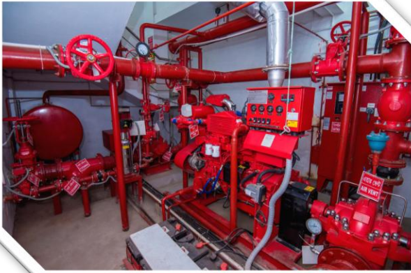
Fire Control System