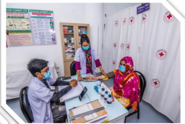
Health Care Room